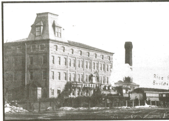
FLAKED RICE BUILDING "The Food of The Century" Matawan, New Jersey

A drive through Matawan today would reveal the town to be one of well-kept residential areas, local shopping and restaurants. What is not so apparent, however, is that Matawan was once the home of a considerable number of industries. It probably had more industries than many towns of its size in the state.