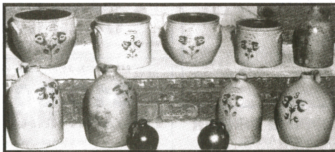
Pottery produced in Matawan over 150 years ago

SEE PAGE 4 FOR OTHER MATAWAN INDUSTRIES OF YEARS AGO