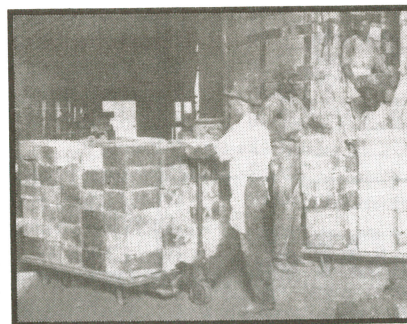
Removing the tile from the kiln after baking at the Matawan Tile Co.

Like many other industries in Matawan, most of the tile companies were forced out of business by the depression. The ones that did survive only operated until World War II when they were converted to other purposes. Tiles that were made in Matawan lined the walls of subway tunnels, swimming pools, and bathrooms all across the country. But today, little is left to mark the fact that factories ever existed. Matawan's tile industry is one of the best examples of the great achievements and far-reaching influence of this town and its products.