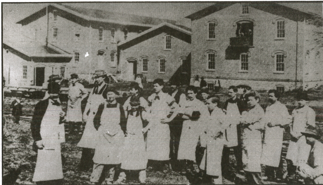
THE RUE POTTERY COMPANY AND WORKMEN IN 1860 (formerly located at 32 Main Street, Matawan)